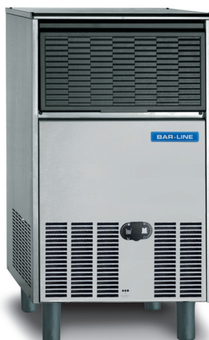
B 5522 AS/WS