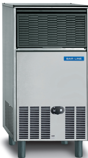
B 7040 AS/WS