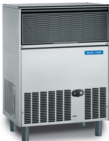
B 9050 AS/WS

Bar Line Equipment range is the newly released EU made ice makers for Thimble-shaped rounded ice cubes coming from Bar Line.